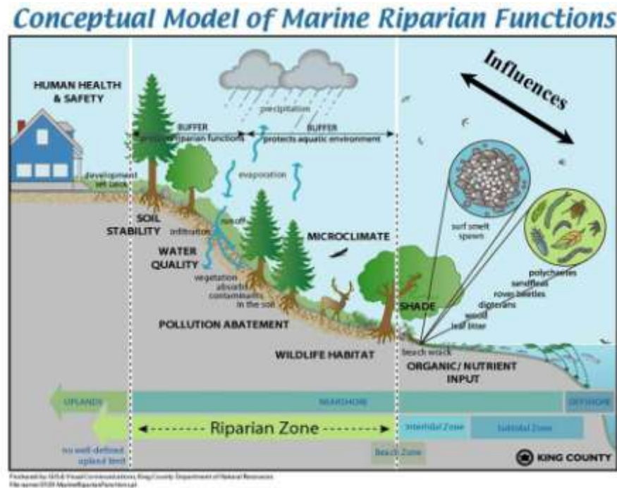
Figure 1. Conceptual model of marine riparian functions, used to illustrate various riparian functions and the use of buffers to protect both aquatic systems and riparian functions. Illustration also shows a development setback from the riparian area.

Figure 1 illustrates many of these functions, along with delineations of conceptual management buffers.